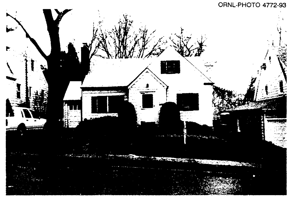
Fig. 1. View looking northeast at 77 Sinninger Street, Maywood, New Jersey (MJ052).