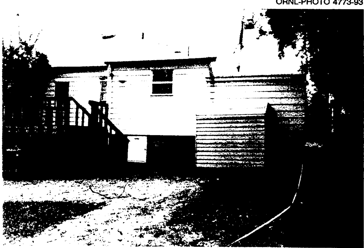
Fig. 2. View looking southwest at 77 Sinninger Street, Maywood, New Jersey (MJ052).