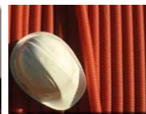
Related Web Sites