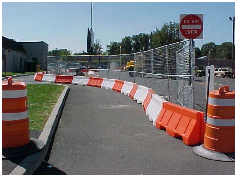
A well-marked and protected walkway adjacent to a Corps work site ensures pedestrian safety.