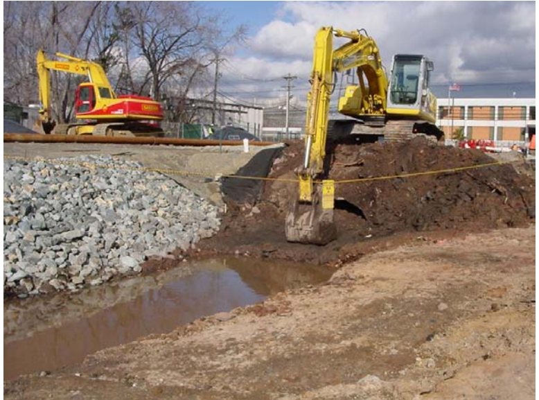
Excavation at an open drainage channel on the Essex Street, Lodi property.

These cleanups, or removal actions, were authorized by the Army Corps in November 2001 after a mandated regulatory and public review and comment process. In March 2002, the Corps successfully completed cleanup of a commercial property on Route 46 in Lodi under this same authority. Eleven properties at the Maywood Site are eligible for removal actions under this authorization. Cleanup decisions for the remaining site properties will be outlined in a Record of Decision document (see page 3).